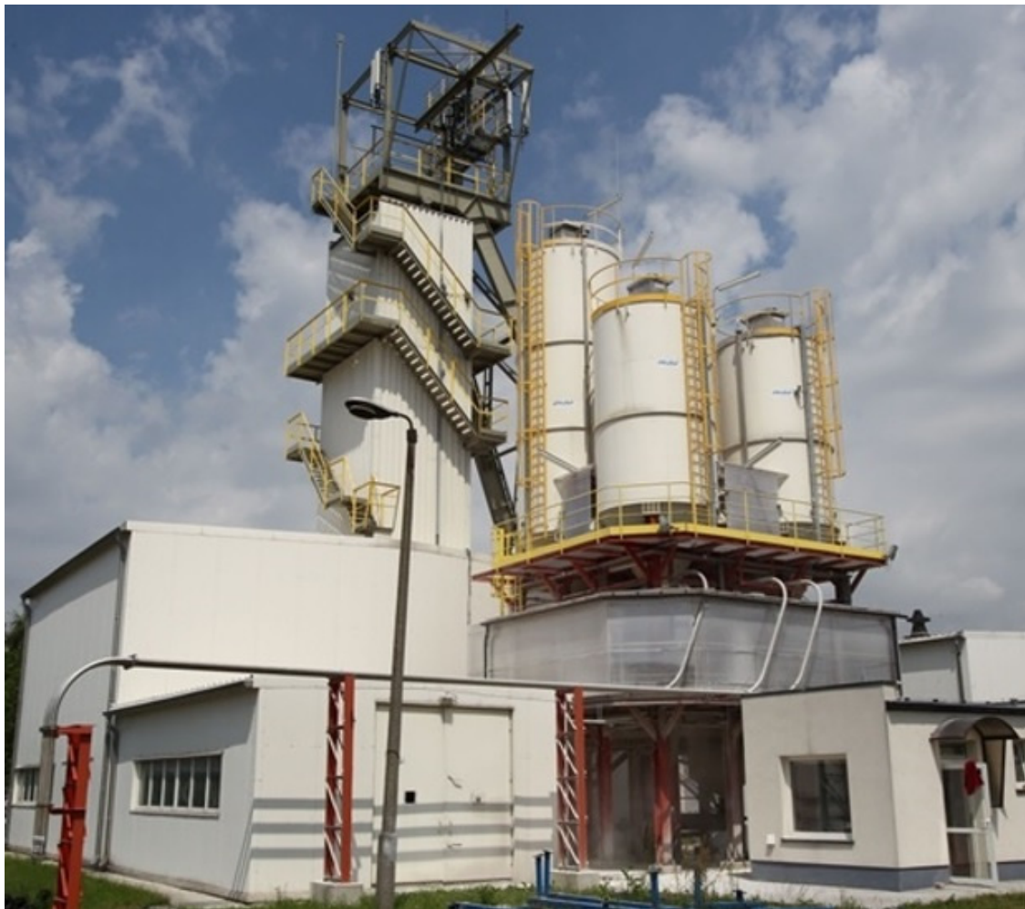
Figure 6. Injection node [9].

First, the final sections of these cross-sections, which were located in the mine's hazard zone and in the vicinity of the Mina cross-section, were dismantled. An total of 342 \text{ m}^3 of sealing slurry, prepared in saturated brine, was pumped beyond the injection dam into the Poniatowski cross-section. The Kunegunda transverse, located on the second higher level, was liquidated by filling its final 92 m length with sealing slurry by injecting 458 \text{ m}^3 of slurry. In order to eliminate these cross-sections, original recipes of the cement slurry were developed and implemented [23,32–34], prepared on the surface and pressed with previously built-in pipelines in the shaft and selected sidewalks to the ends of the cross-sections to be liquidated. After the pipeline injection had been proven in practice, the "Wieliczka" Salt Mine commissioned the design and construction of a specialized injection node located near the Kościuszko shaft, which was used to transport the slurry in the subsequent stages of injection works (Figure 6).