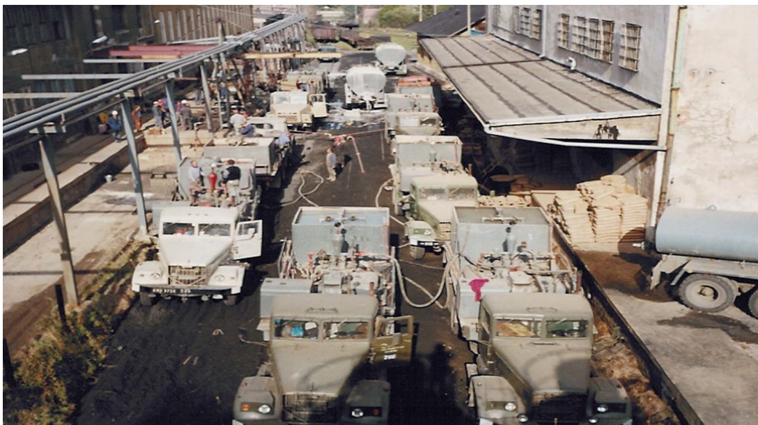
Figure 5. Preparation and injection of the slurry to the Poniatowski transverse [21].

In the initial stage of implementation, preparation and injection are carried out with the use of classic devices and accessories used for cementing deep boreholes (Figure 5).