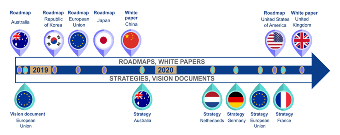
Figure 1. The latest hydrogen-related government documents cited in this paper.

In 2019, there were 470 hydrogen refueling stations in the world. Compared to 2018, there was a significant increase in their number by over 20%. Most of these stations are located in Japan (113). Germany has 81, the United States has 64, and China has 61 [37]. The number of FCEVs is projected to continue to increase, e.g., in China to one million by 2030 [39], in Korea, to 800,000 by 2030 [8], in the Netherlands to 15,000 by 2030 [5], in France to 22,500 by 2028 [40], and in Japan to 800,000 by 2030 [9].