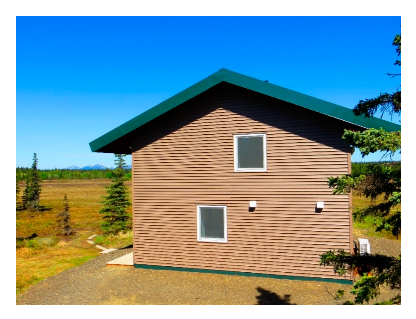
Figure 1. Photograph of the case study house from the outside.

The house falls into the category of a net-zero energy ready building, consuming roughly 3000 kilowatt hours (kWh) annually for all energy needs. This amount is sufficiently small, due to the energy-efficient nature of the construction, the appliances and the homeowner's lifestyle, that the energy demand could easily be produced through renewable energy. If the annual 3000 kWh energy demand is sourced from renewable sources the house would be considered net zero energy. Figure 1 shows a photograph of the case study house.