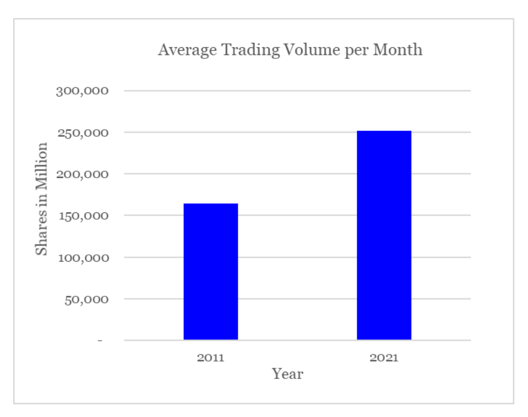
Figure 1. Change in trading volume in 2011 vs. 2021. This figure plots the average number of shares executed in the overall market per month in 2011 and 2021. The data was taken from the CBOE's U.S. Equities Market Volume Summary (https://www.cboe.com/us/equities/market_share, accessed date: 20 August 2021).