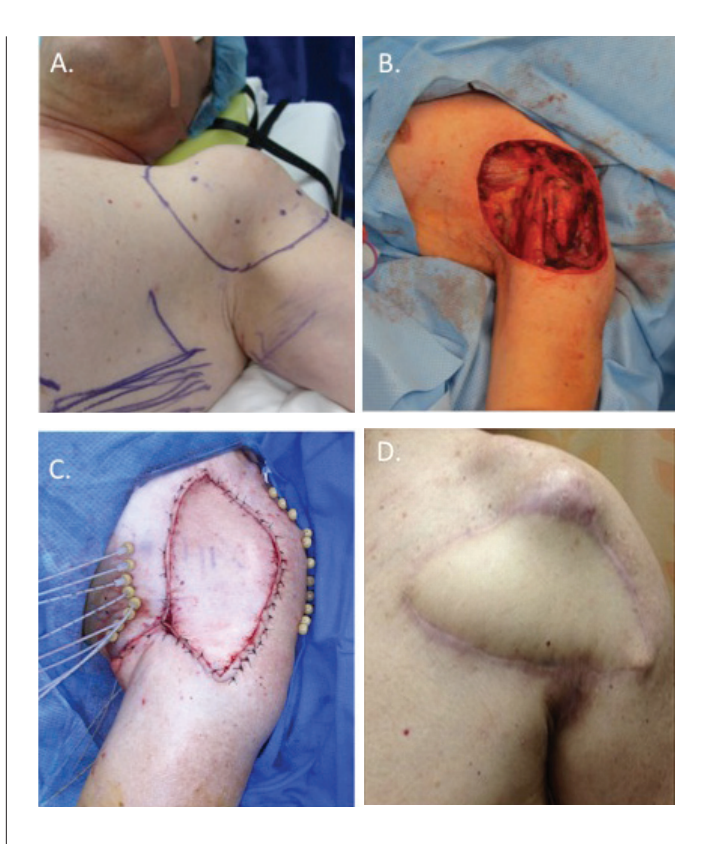
FIGURE 1 (A) Soft-tissue sarcoma in the left shoulder, involving the deltoid and pectoralis major muscle. (B) Post-resection surgical defect, measuring 14 \times 20 \text{ cm}^2 , demonstrating exposed left shoulder capsule. (C) Brachytherapy catheters (n = 11) positioned intraoperatively above the tumour bed and below the latissimus dorsi myocutaneous flap. (D) At 6 months postoperatively, the flap has healed with minimal complications.

Unfortunately, shortly thereafter, the patient experienced a recurrence in close proximity to the original site of resection.