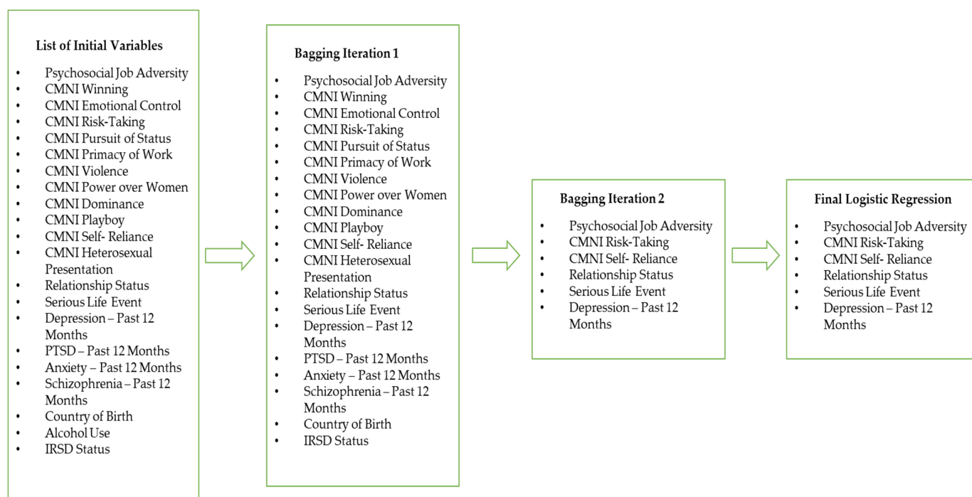
Figure 2. Logistic Regression Variable Selection Procedure.

Table 3 details the final logistic regression model. Presence of psychosocial job adversity, higher scores on the CMNI domains of self-reliance and risk-taking, not being in a relationship and experiencing a significant life event were all associated with increased likelihood of suicidal ideation presence. Self-reported depression in the past 12 months was associated with a greater than six times increased odds of the likelihood of experiencing suicidal ideation. Presence of outliers were assessed (none identified), the model passed the Stata Linktest and a Hosmer-Lemeshow goodness-of-fit test ( X^2(8, n = 1702) = 7.87 , p = 0.45 ) showed the good calibration of the model.