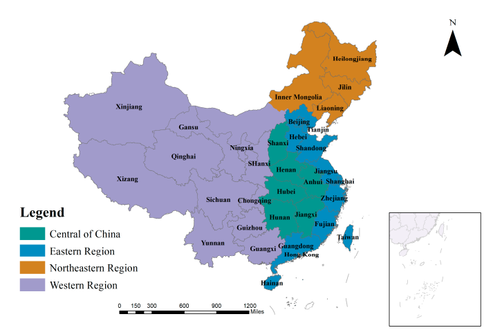
Figure 1. The study area: China's 34 provincial administrative units and four economic regions.

3.2. Data Declaration and Variable Selection