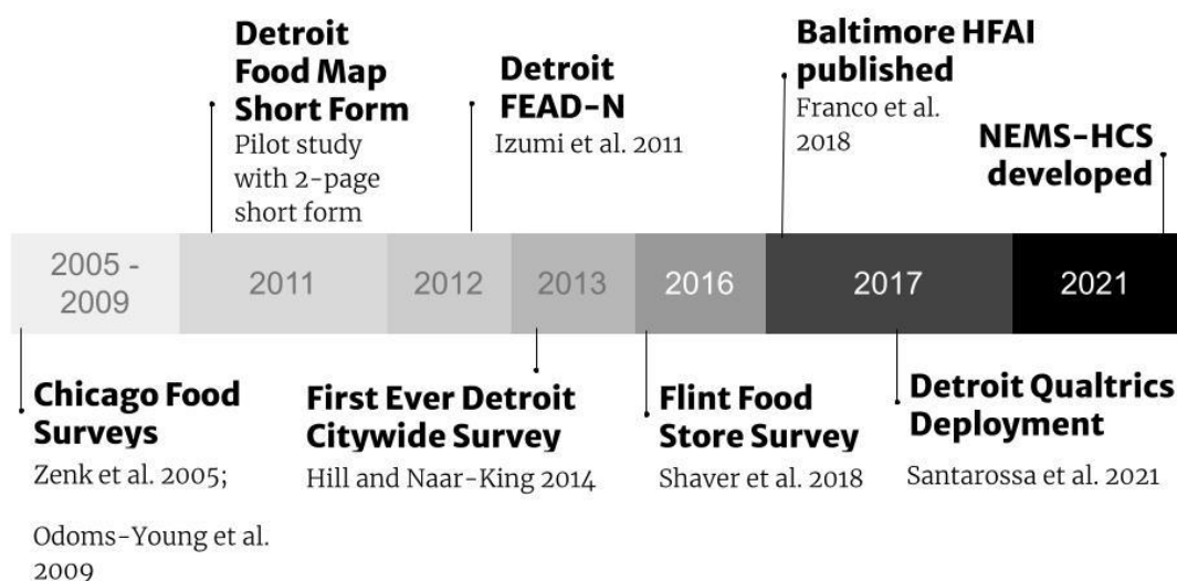
Figure 1. Timeline of food environment assessment instruments and their development. [4,23,24,26,27,30,31].

For this study, the 10 food categories used from the NEMS-HCS were matched to corresponding food item categories of the Healthy Eating Index (HEI) in order to assess opportunity or support of the DGAs (see additional information below). Categories included milk and dairy, fruits, vegetables, frozen fruits and vegetables, meat and protein, beverages, bread, and cereal (see Table 1). Availability and pricing data were collected for all categories. Quality was assessed for fresh fruits and vegetables.