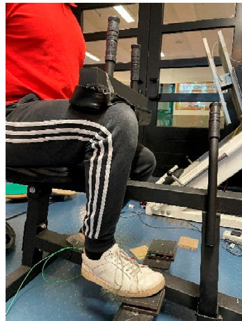
Figure 1. Calf-muscle-testing device (CMD) measuring the maximum isometric strength in pre- and post-test with force plates.