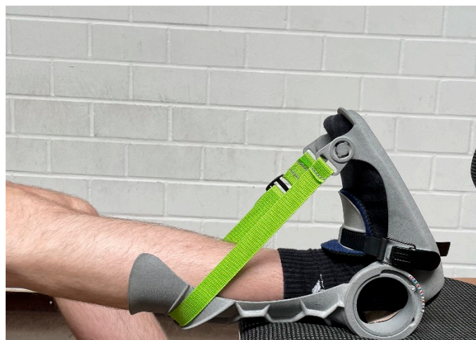
Figure 2. Orthosis used for calf-muscle stretching.