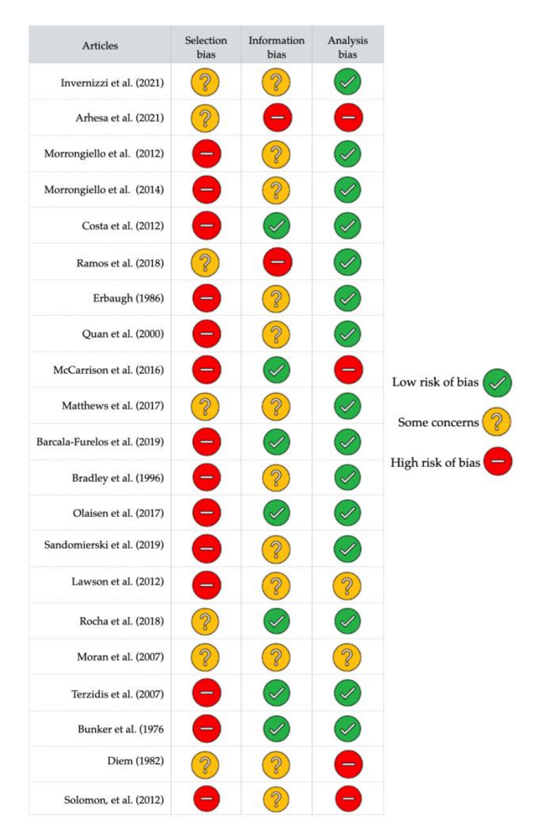
Figure 3. Risk of bias assessment [22,43–62].