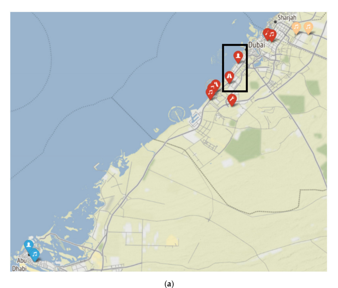
Figure 2. Cont.

In this study, Geographic Information System (GIS) technology was utilized to gain some understanding of the spatial distribution and content of a selection of the tweets collected through 2015 according to the source type, Figure 2. It is noted that the most annoying sources, such as music, are in densely populated districts within cities; there appears to be a link between highly populated areas and the frequency of complaints. It should be recognized from municipalities that the number of complaints will rise in these areas as the urban population expands in the UAE.