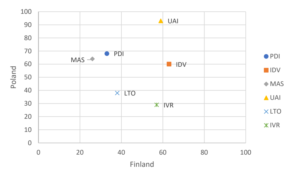
Figure 1. The values of indexes of cultural dimensions according to Hofstede [17] for Poland and Finland.