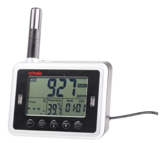
Figure 2. Benchtop display data logger rotronic CL11 unit.

Data loggers were placed so that the sensors were not directly affected by heat sources (radiators) or sunlight, and were outside of the children's breathing zone (which is at a height of between 0.5 and 0.7 m), i.e., at a height of approximately h = 1.5 m. The sensors were placed away from windows in the middle of the classroom and approximately 0.6 m from the wall. The data logger rotronic CL 11 (Rotronic Instruments, Crawley, UK) (Figure 2) was used to measure T_{ai} , RH_{ai} and CO_2 [36], with an infrared sensor (NDIR) with automatic calibration for CO_2 measurements, and a humidity sensor ROTRONIC HYGROMER<sup>®</sup> IN-1 (Rotronic Instruments, Crawley, UK) and NTC (Rotronic Instruments, Crawley, UK) thermistor sensor for humidity measurements The data from the data logger is shown in Table 2.