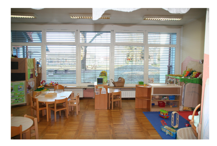
Figure 1. Kindergarten classroom, 2A measured interval.

The research methodology covered experimental analyses of individual parameters of indoor air quality and thermal comfort in kindergartens in Slovenia in the winter before and during the COVID-19 pandemic. Carbon dioxide concentration CO<sub>2</sub> (ppm) together with indoor air temperatures T_{ai} (C°) and indoor relative humidity RH<sub>ai</sub> (%) were monitored with continued in situ measurements. The data on outdoor air temperatures and humidity are summarized from the archives of the Slovenian Environment Agency. As part of the measurements, records of the number of children present in classrooms and ventilation intervals were kept every day in addition to air quality and thermal comfort parameter monitoring. The measurements were carried out in eight kindergartens in the winter before and during the COVID-19 pandemic in Slovenia for 125 days, i.e., 69 days in the 2019–2020 heating season before the COVID-19 pandemic, and 56 days in the 2020–2021 heating season during the COVID-19 pandemic (Figure 1). Parameters measured in the occupation interval were analysed, and data collection corresponding to holidays and non-school days have been removed in order to ensure minimal distortion of the results.