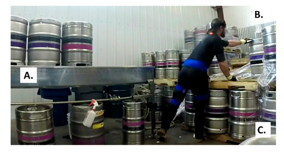
Figure 1. The kegging line work area included the roller conveyor ( A ) and empty kegs on pallets identified as high kegs ( B ) and low kegs ( C ).

moved the kegs through the cleaning and filling processes. Kegs were cleaned externally, sterilized internally, and then filled with beer. During the task of loading kegs onto the roller conveyor, workers stood between the roller conveyor and incoming pallet of empty kegs (Figure 1). Workers would typically lift, rotate, carry (a short distance), and flip empty kegs upside down. From this position, kegs were then injected with a cleaning solution, decanted, rinsed, and filled with beer.