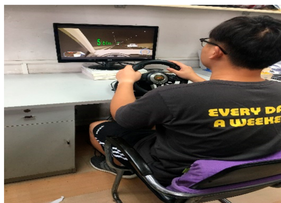
Figure 1. Driving simulator.

During the experiment, gaze position data were collected by the Tobii X2-60 eye tracker, which was produced by Tobii Electronic Technology (Suzhou, China) Co. Ltd. The sampling rate was 60 Hz and the accuracy was 0.34^\circ . Velocity data were collected by a driving simulator included in the UC-win/road simulation software, which was produced by the Japan FORUM 8 Company (Tokyo, Japan), and a driving operating system produced by PXN-V3 Pro, ShenZhen PXN Electronics Technology Co. Ltd. (Shenzhen, China), as shown in Figure 1. The software included "Terrain Input", "Road Definition", "Road Generation and Traffic Flow Generation", and "Edit, Output, Virtual Reality Simulation". The sampling rate was 15 Hz. The driving operating system included a steering wheel, pedals, gears, and a handbrake controller. The noncontact design was easy to use, performed stably, and has been widely used in universities and research institutions.