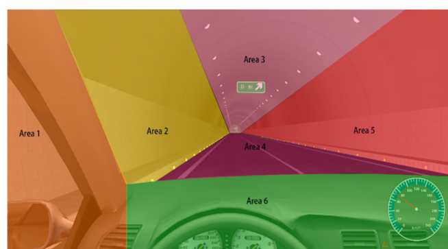
Figure 2. Areas of interest.

A participant's field of vision (FOV) was divided into six areas, as shown in Figure 2 and listed in Table 1. Area 1 was the left side of the visual field, area 2 was the front-left of the visual field, area 3 was directly above the visual field, area 4 was the road surface, area 5 was the front-right of the visual field, and area 6 was the cab area, as shown in Table 2.