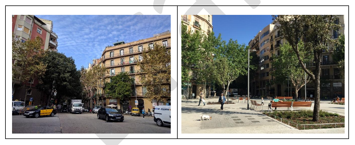
Figure A2. Plaça del mercat (newly created plaza in Sant Antoni neighbourhood, right) and crossing similar to what it was before (Manso with Viladomat streets, left).