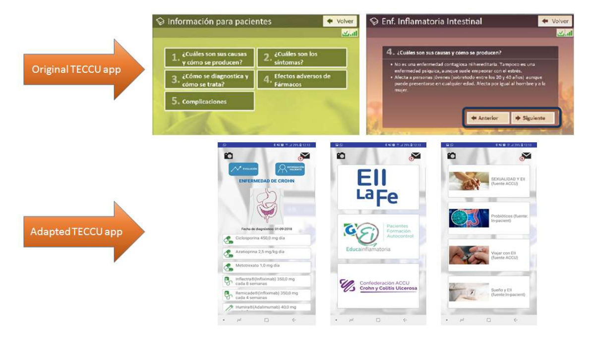
Figure 5. Updates to the educational contents and the summary of the patients' disease course in the TECCU app.

Patients from the second and third focus groups appreciated these adaptations to this educational content. Yet, they also indicated that it was important to make the information included in the questionnaires more comprehensible and practical. In this sense, we adapted simple and validated patient-reported outcomes (PROs) [40–44], and included some information to illustrate in text and images the meaning of specific terms like aphtha, arthralgia, etc. Moreover, the app was redesigned to include a section that contained a summary of the patients' disease evolution and the medications prescribed (Figure 5).