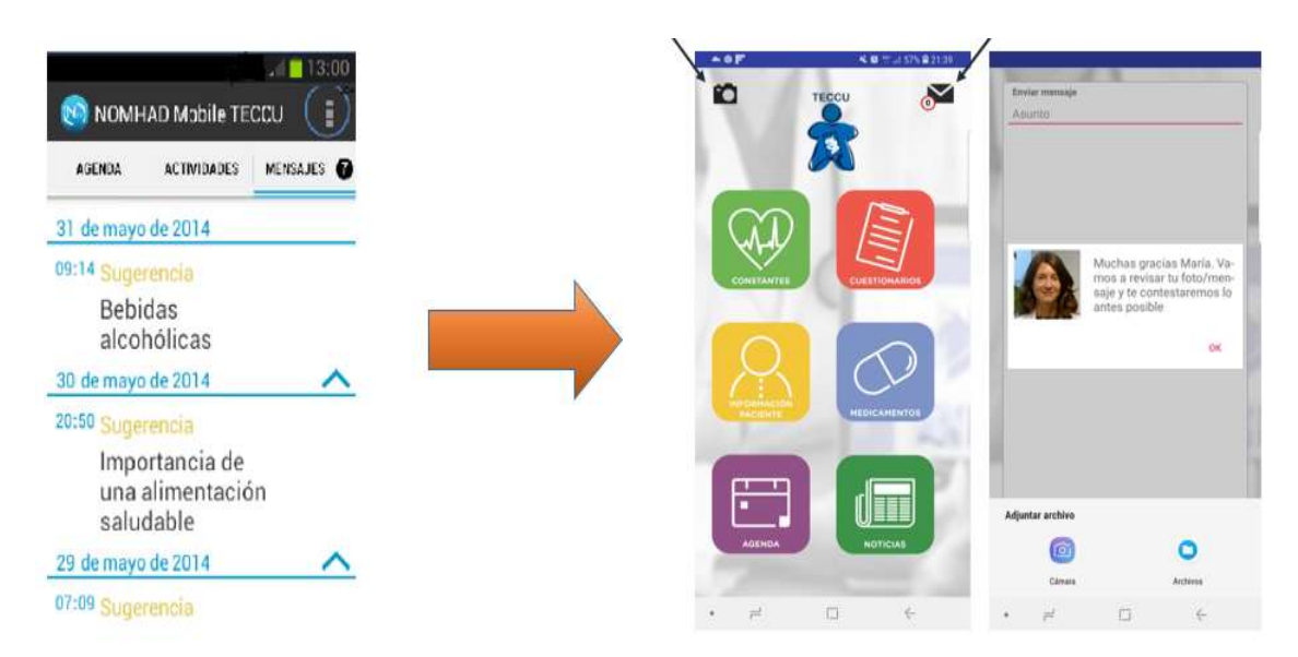
Figure 4. Adaptations to the communication process in the TECCU app.

The links to the messaging system and the camera to send images are marked with arrows.