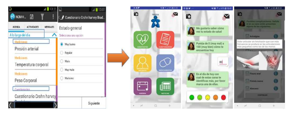
Figure 3. Adaptations to the TECCU platform design to improve usability.

In the second and third focus groups, the patients made similar comments about the usability of the platform, indicating that it was fast, intuitive, and that they also valued the messaging system. However, many of them still noted that some of the content was not clear or easy to read. Moreover, they missed some feedback from the questionnaires and they did not understand the meaning of some of the specific terms. To address these comments, we reassessed the readability of the platform's components and adapted the patient-reported outcomes (PROs) [40–44]. Beyond the adaptation of the self-testing frequency, we also incorporated the option to self-evaluate disease activity, quality of life, and issues related to medication to a conversation format (Figure 3). In this sense, our group is currently working on incorporating artificial intelligence functionality to create a chat-bot designed for IBD patients.