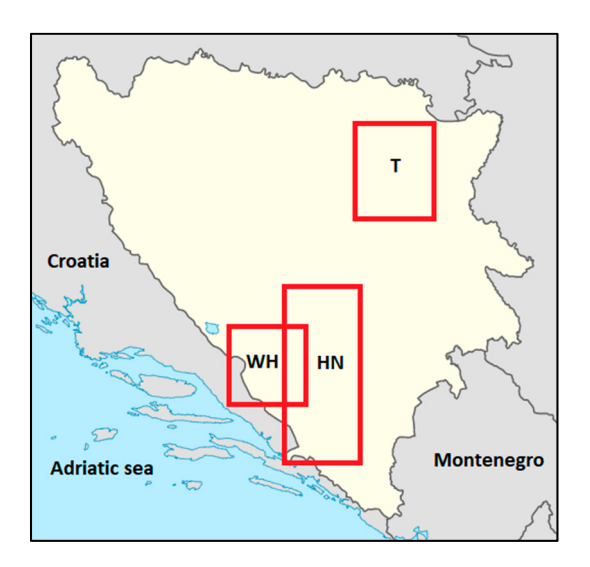
Figure 1. Bosnia and Herzegovina with the approximate location of the Counties where the sample was drawn from (HN-Herzegovina Neretva County, WH-Western Herzegovina County, T-Tuzla County).