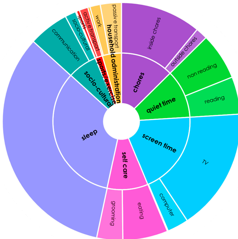
Figure 2. Composite activity profile presenting a typical profile of 24-h time use. Mean time spent in MARCA superdomains (in min/d) is presented using arithmetic means from baseline MARCA data.

All values are expressed as mean (SD) and represent time spent in each category in minutes per day (min/d). n = number.