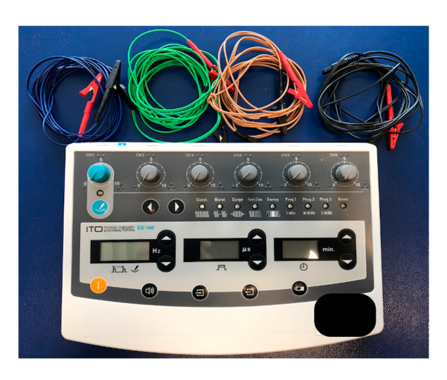
Figure 3. ITO ES-160 unit.