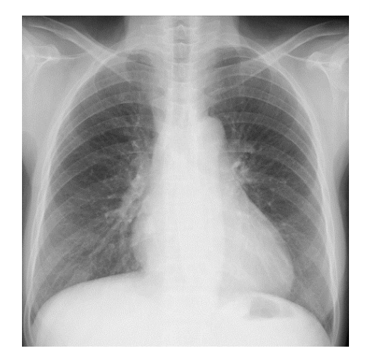
Figure 1. Chest X-ray image on admission to the previous hospital. No abnormal findings were observed.

At the time of transfer, the body temperature was 38.9 °C. The blood pressure was 142/99 mmHg and the heart rate was 108/min. Physical examination showed no rales or abnormal cardiac sounds. Again, there were no palpable lymph nodes on the body surface. Laboratory data showed WBC 23,100/ \mu L, BUN 63.4 mg/dL, Cre 9.72 mg/dL, CYFRA 7.6 ng/mL, PRO-GRP 345 pg/mL, and sIL-2R 3140 U/L (Table 1). PRO-GRP was determined to be rising due to renal failure.