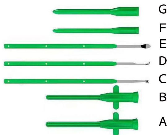
Figure 1. Modified Soft Tissue Release Kit. (A) Thick (7 mm) cannula with a lining core; (B) Thin (6 mm) cannula with a lining core; (C) Spade knife; (D) Hook knife; (E) Detacher; (F) Thin (6 mm) expander; (G) Thick (7 mm) expander.

This kit was independently modified by us. It was composed of a thick (7 mm) cannula with a lining core, thin (6 mm) cannula with a lining core, spade knife, hook knife, detacher, thin (6 mm) expander and thick (7 mm) expander (Figure 1). This kit was originally designed for the endoscopic treatment of carpal tunnel syndrome. On the basis of the proven efficacy and safety of endoscopic release of the transverse carpal ligament using this kit, we decided to enlarge its applied area to the endoscopic release of the gastrocnemius aponeurosis.