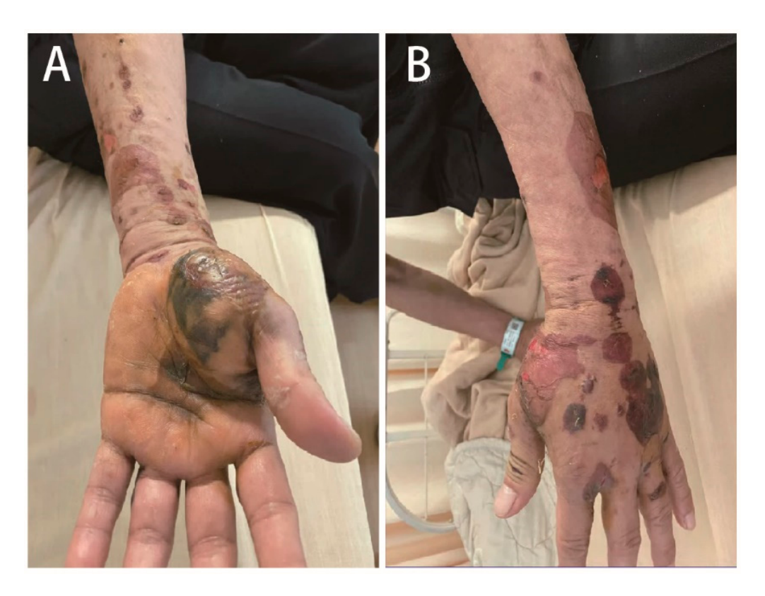
Figure 3. On day 7 of the snakebite, the post-snakebite compartment syndrome in the affected limb improved by the administration of antivenom and aspiration of multiple bullae to eliminate venom depots.