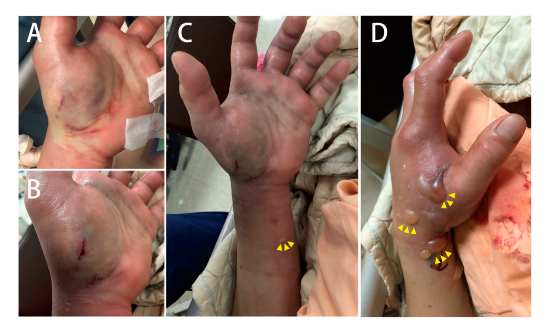
Figure 1. ( A , B ) Two puncture and laceration wounds on the left palm, ( C ) a tiny vesicle formed at the left wrist, and ( D ) progressed to multiple bullae after one hour.