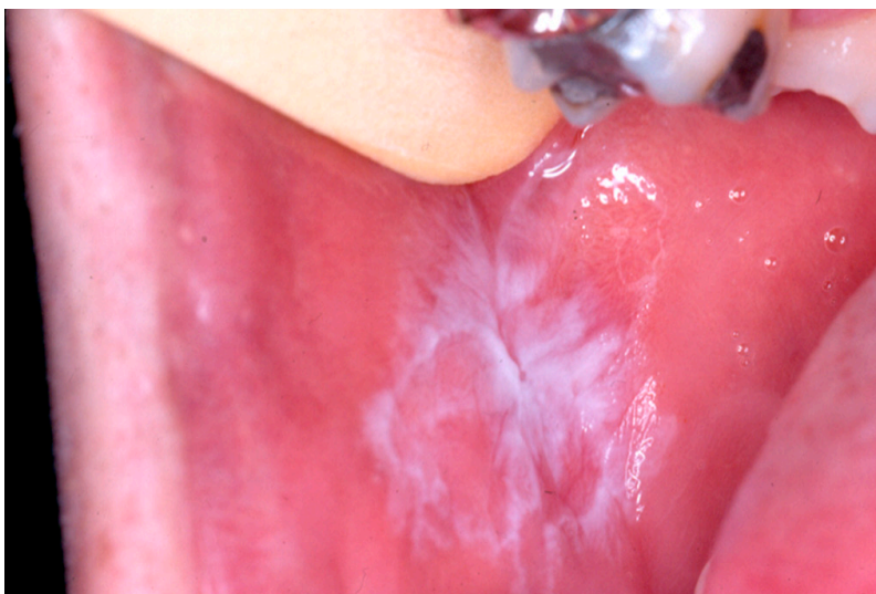
Figure 3. OLP with clinical presentation predominantly reticular type, on the buccal mucosa.