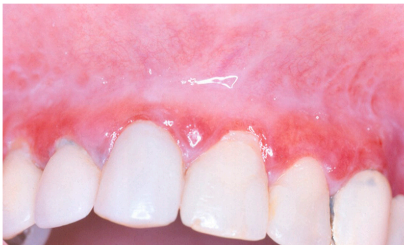
Figure 2. Typical clinical presentation of OLP erosive type, on the gingiva of maxillary anterior teeth.