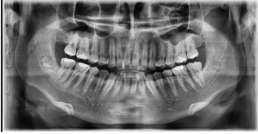
Figure 2. ( a ): Right mandibular wisdom with pain and sensivity due to pericoronitis. ( b ): X-ray after 14 days from the coronectomy. ( c ): OPT after three years of follow-up.