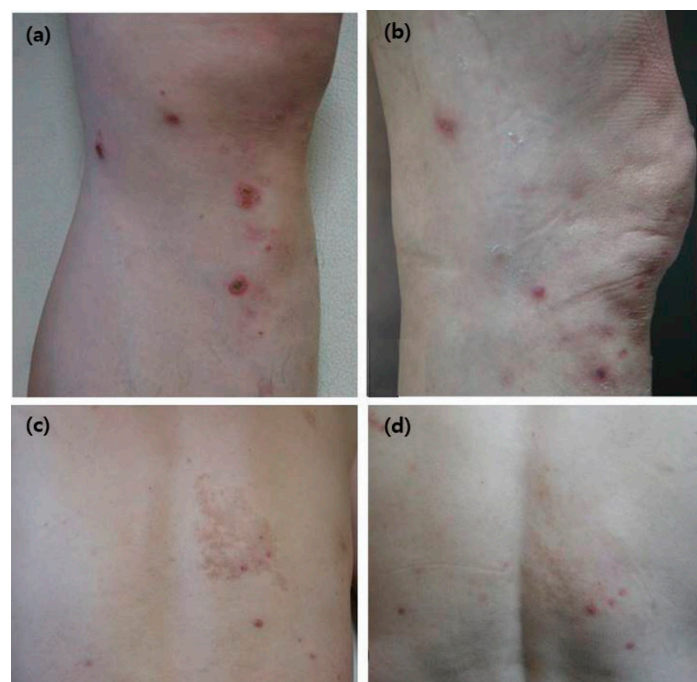
Figure 1. Representative clinical manifestation after treatment with alitretinoin in Case 1 (61 year-old man), a patient with prurigo nodularis: (a,c) multiple erythematous to brownish papules and nodules on the back and both legs (b,d).

A 61 year-old man presented with several one month-old erythematous to brownish papules and nodules on the back and both legs (Figure 1a,c). He had diabetes mellitus. The initial clinical suspicion was prurigo nodularis and punch biopsy was done. Microscopic examination showed hyperkeratotic epidermis with acanthosis and parakeratosis. Elongated and irregular rete ridges were observed with dense dermal perivascular infiltration (Figure 2a,b). The final diagnosis was prurigo nodularis. Initially, he was treated with oral cyclosporine 100 mg/day for 4 weeks. However, relief of the symptoms was insufficient and oral alitretinoin was started at a dose of 30 mg/day. After 4 weeks of alitretinoin treatment, symptoms and skin lesions were improved, and with 8 weeks of treatment (Figure 1b,d), he stopped medical treatment and achieved complete remission without recurrence.