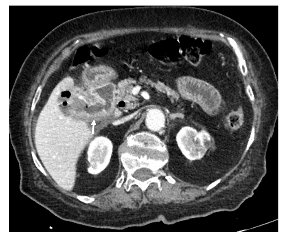
Figure 4. 87-year-old female. Abdominal CT scan, axial plane, portovenous phase. Collapsed gallbladder, with thickened walls, pericholecystitis and air in the pericholecystic space. Also, a connecting path between the gallbladder and duodenum is visible (arrow)—cholecystoduodenal fistula.