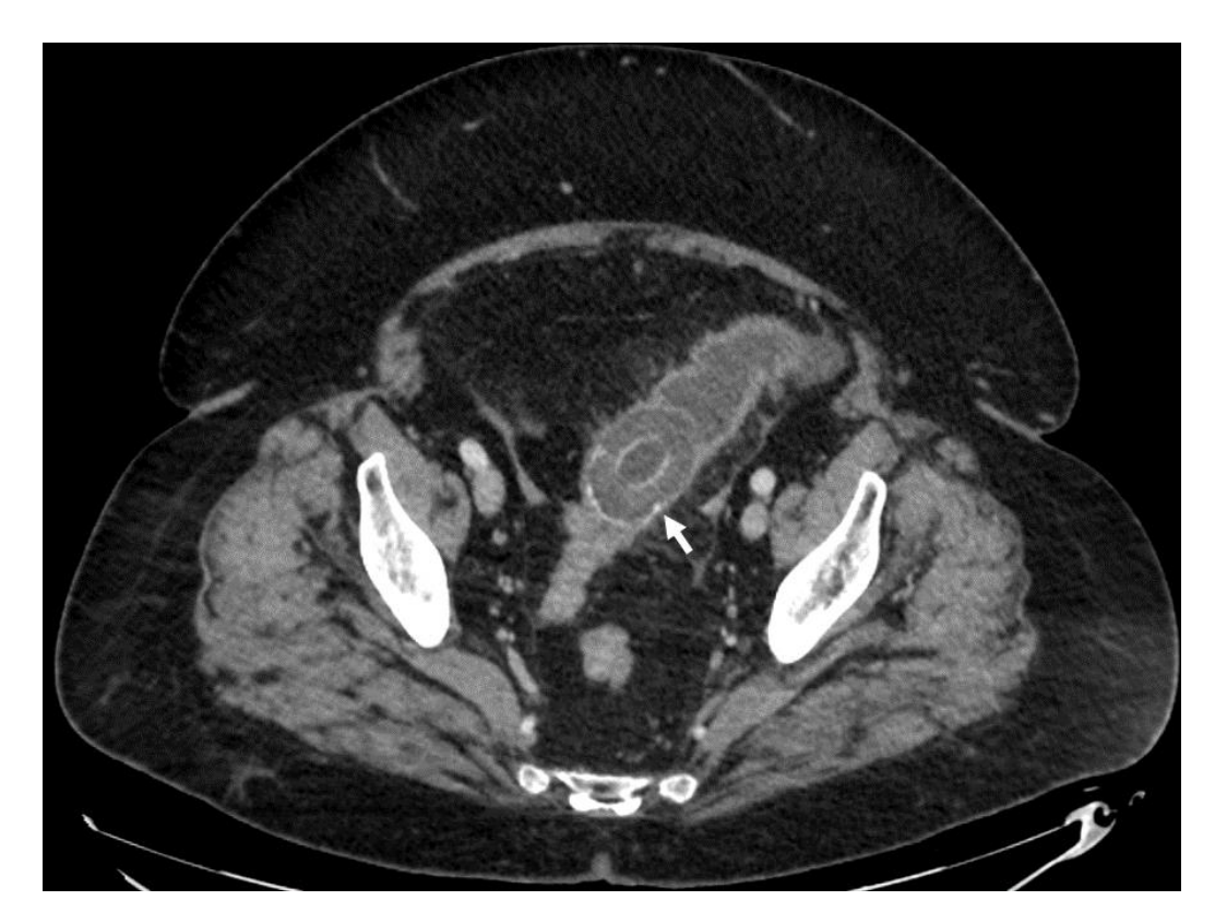
Figure 3. 69-year-old female. Abdominal CT scan, axial plane, portovenous phase. The gallstone that migrated through cholecystocolic fistula is obstructing the lumen of sigma (arrow).