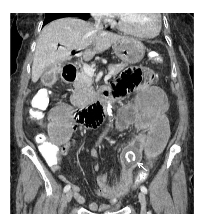
Figure 1. 82-year-old female. Abdominal CT scan, coronal plane, portovenous phase. The transition point of the obstruction is visible, the gall stone is obstructing the small bowel lumen (arrow), distal loops are collapsed.