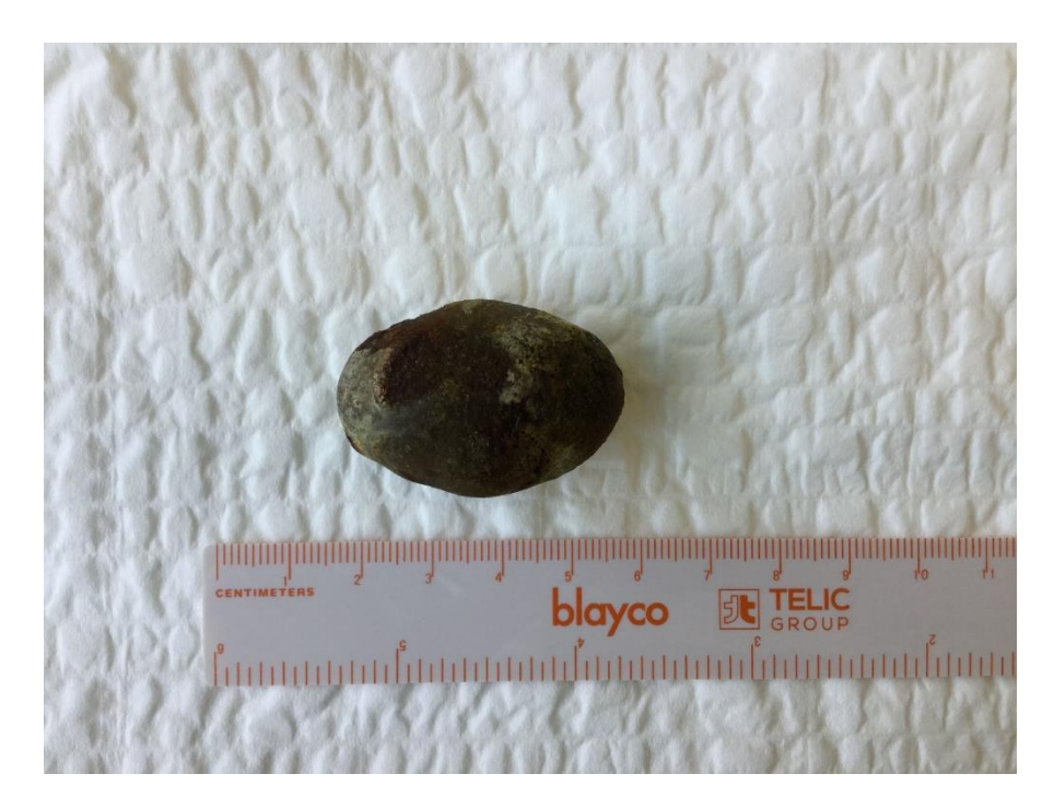
Figure 7. A 4 \times 3 cm gallstone removed during laparoscopically assisted enterolithotomy.