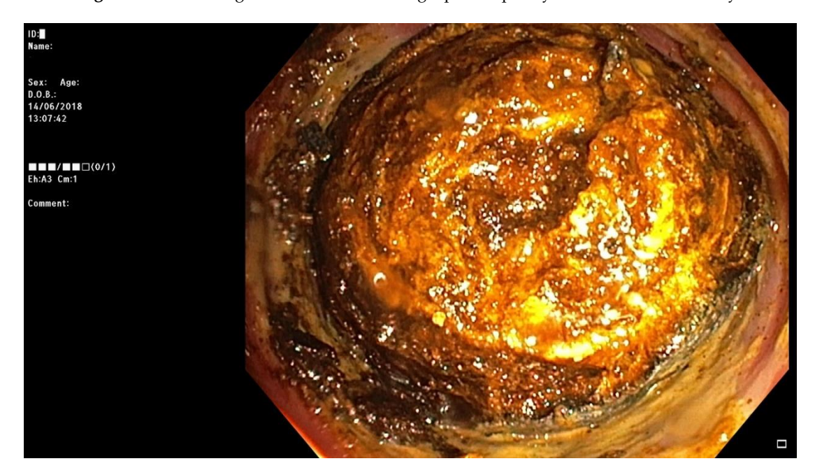
Figure 8. Impacted gallstone in the sigmoid colon successfully removed during colonoscopy.