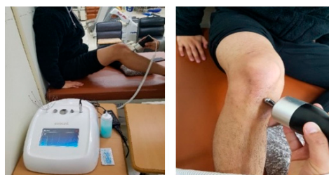
Figure 2. Vibroacoustic intervention applied on an anterior cruciate ligament reconstruction.

Note: RPE, ratings of perceived exertion or Borg scale.