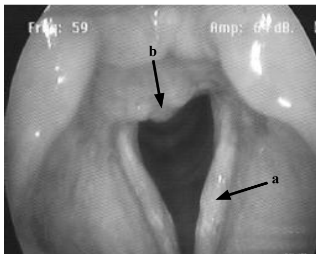
Fig. 2. The most significant laryngoscopic signs of RL

It has been reported in the literature that among the patients seeking help for otolaryngologist, up to