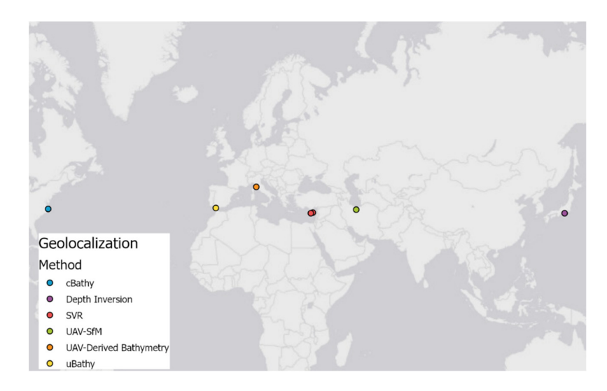
Figure 2. Map presenting the location of each measurement site according to the method used to determine the waterbody depth.