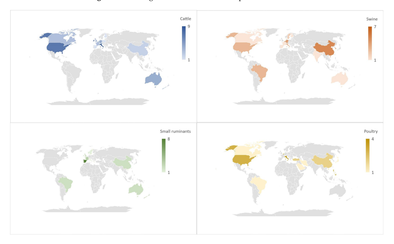
Figure 2. Number of articles related to PLF published worldwide in relation to the species (blue: cattle; orange: swine; green: sheep and goat; yellow: poultry).