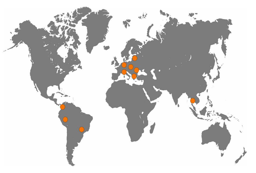
Figure 1. Countries where the research articles were conducted.

This Special Issue contains a total of 18 articles from many different countries, including Brazil, Bulgaria, Ecuador, Germany, Malaysia, Peru, Poland, Romania, Slovakia, and Slovenia situated on three continents (Figure 1).