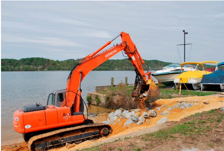
Figure S2. Reconstruction of Map Turtle nesting beach as a Living Shoreline.