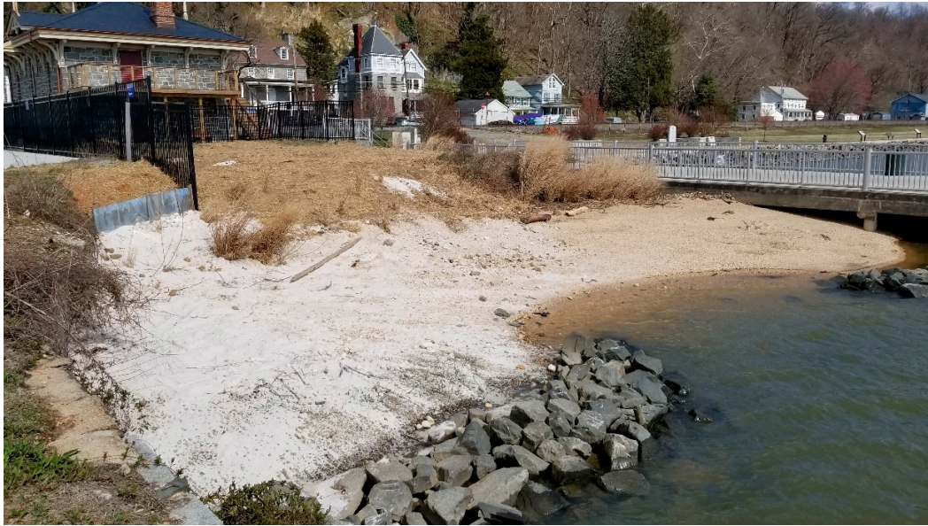
Figure S3. Map Turtle nesting beach following reconstruction