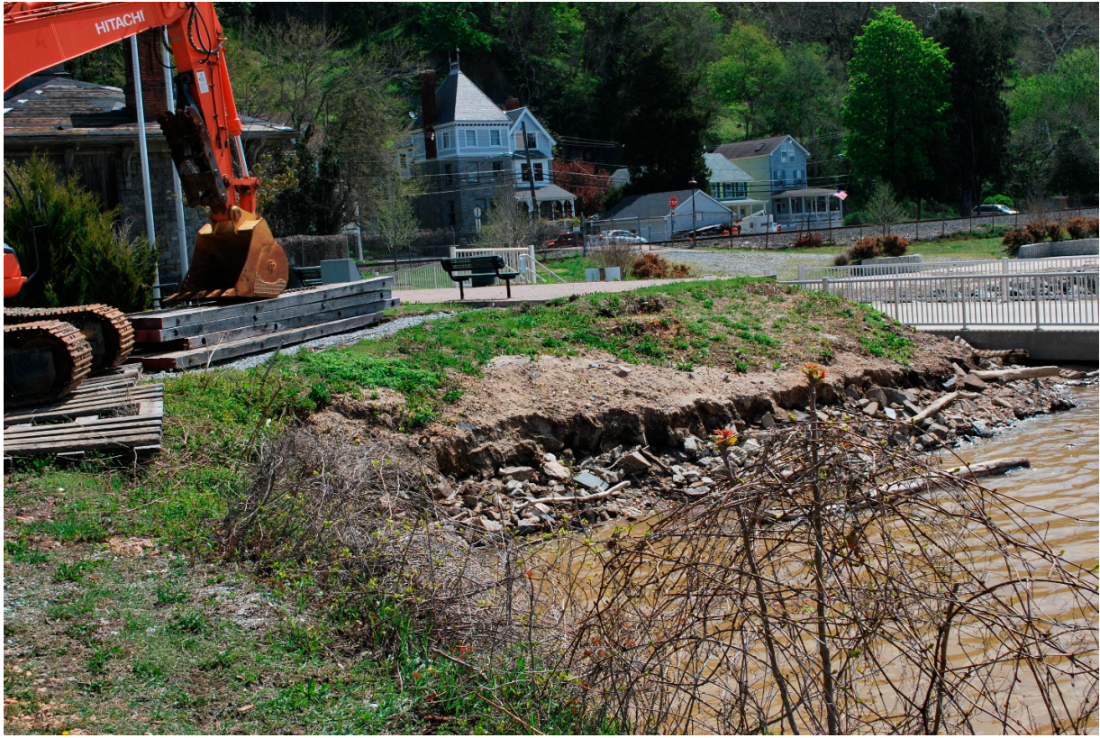
Figure S1. Map Turtle nesting beach prior to reconstruction