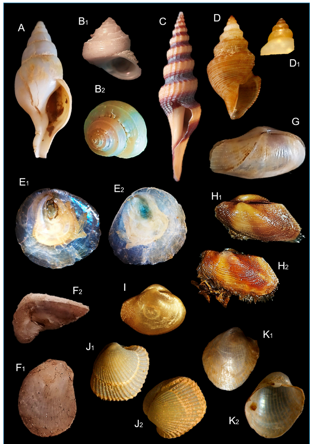
Figure 3. New deep-see molluscans records from Ses Olives, Ausias March and Emile Baudot seamounts in the Mallorca Channel (Balearic Islands): (A) Colus jeffreysianus ; (B 1 ,B 2 ) Cantrainea peloritana ; (C) Fusiturris similis ; (D,D 1 ) Gymmobela abyssorum ; (E 1 ,E 2 ) Pododesmus squama ; (F 1 ,F 2 ) Spondylus gussonii ; (G) Allogramma formosa ; (H 1 ,H 2 ) Asperarca nodulosa ; (I) Cetomya neaeroides ; (J 1 ,J 2 ) Haliris granulata ; and (K 1 ,K 2 ) Policordia gemma . Images not to scale.

Distribution: Colus jeffreysianus lives in deep water from 400 to 2100 m from South Iceland and Norway, the Shetland Islands and the Faroes, the Kattegat and SW Skagerrak and off the British Isles. Further southwards it is found on the continental shelf of the Bay of Biscay, the Iberian Peninsula and the western Mediterranean Sea [43]. It is not common