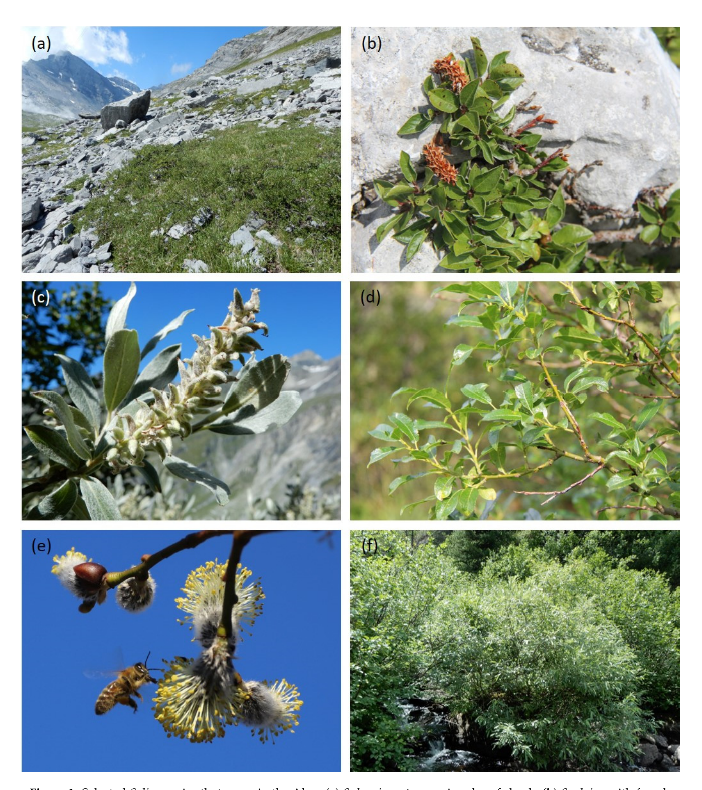
Figure 1. Selected Salix species that occur in the Alps. (a) S. breviserrata creeping dwarf shrub, (b) S. alpina with female catkins, (c) S. glaucosericea with female catkin, (d) S. mielichhoferi leaves, (e) S. aurita male catkins, (f) S. laggeri shrub.

Willows have adapted to a suite of different habitats across almost the entire elevational gradient from valley bottoms up to high alpine and subnival sites [11,25,26]. Willow stands often dominate the vegetation, and many species are characteristic for subalpine and alpine shrub communities, e.g., the associations Salicetum caesio-foetidae Br.-Bl. (1964), S. waldsteinianae Beger (1922), Salicetum helveticae Br.-Bl. et al. (1954), and alpine snowbeds,