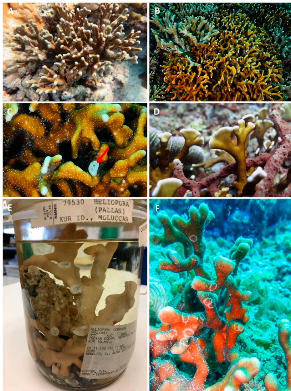
Figure 1. New photographic evidence increases the known distribution of Heliopora hiberniana . (A). Kunfunadhoo Island, Baa Atoll, Maldives, 12 m; (B,C). Wangiwangi Island, Wakatobi Islands, Indonesia, 10–12 m. The red arrow points to a broken branch showing the white skeleton; (D). Gili Islands, Indonesia, 8 m; (E). Specimen #79530 Smithsonian Institute. Collected by Gordon Hendler on the Helix-79 expedition in 1979, station M-99, Kur Island, Moluccas, 8–16 m; (F). Gili Islands, 10 m with annular lesions.

Colonies at the Gili Islands in Indonesia were commonly observed to have white rings with healthy, intact tissue in the centre (Figure 1G). The rings are presumed to be a feeding scar because similar annular lesions observed on Acropora palmata in the Atlantic Ocean, and Psammocora albopicta in South Korea, were formed by the foraging activity of cowfish (Ostraciidae) [11,12]. Further observational studies are needed to determine if a member of the Ostraciidae family is responsible for the Heliopora lesions. These new records advance our understanding of the distribution of this species, but little information is available about its reproductive behaviour or symbiont composition. Further demographic data, along with experimental and post-bleaching survivorship studies are needed to test the hypothesis