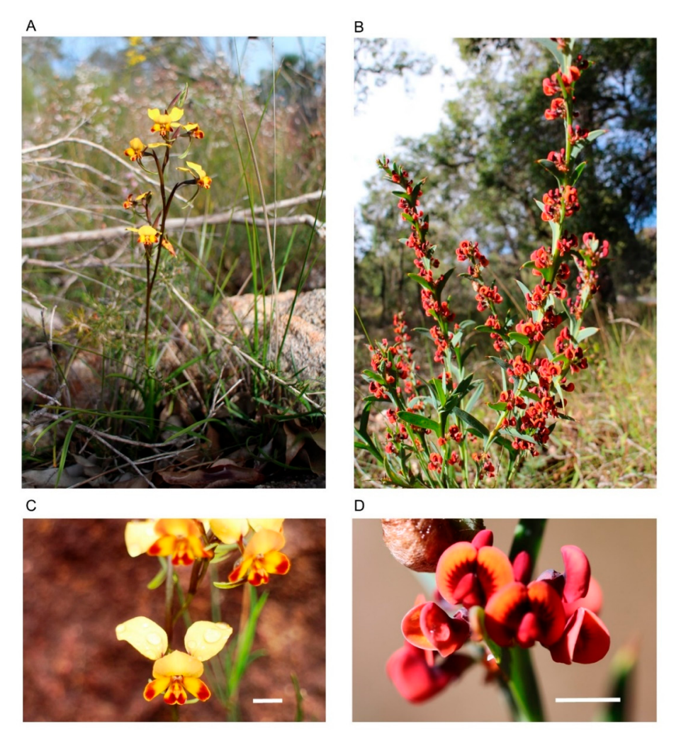
Figure 1. ( A , C ) The rewardless Diuris brumalis (Orchidaceae); ( B , D ) Daviesia decurrens (Faboideae), one of the model species involved in orchid floral mimicry. Scale bar: 5 mm.