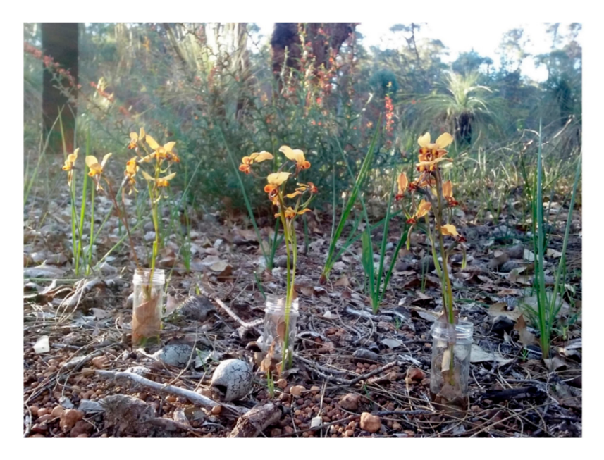
Figure 2. Arrays of orchid flowers of Diuris brumalis (Orchidaceae), presenting two stems in each of the three vials. In the background: a model plant of genus Daviesia (Fabaceae), used for studying the pollination.

of the trial applied in sexually deceptive orchids [17]) was sufficiently adequate for flower recognition and visitation by insects. The experiment was repeated hourly for 20 replicates (15 min each) per day, moving the orchid arrays in rotation among the same four selected model plants (Figure 3), accounting for a total of 30 h.