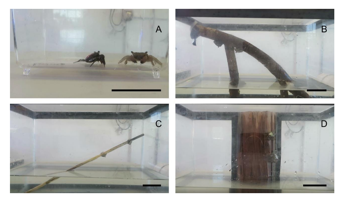
Figure 1. Representations of assays performed on ( A ) neutral structure, ( B ) mangrove structure, ( C ) salt marsh structure, and ( D ) dock structure. Scale bars represent 5 cm.

To understand the impact of source habitat on the ritualistic aggression behavior of A. pisonii , we first conducted behavioral assays in a small plastic aquarium (17.5 \times 10.5 \times 10 \text{ cm}, l \times w \times h) which acted as a neutral surface (Figure 1). We assayed fifteen pairs of crabs from each habitat (n assays = 45) pitting only individuals from the same habitats. To explore effects of habitat-specific differences in morphology, we also explored inter-habitat interactions in the neutral arena by performing 45 additional assays pitting individuals from different habitats (15 assays/habitat combination: dock v marsh, marsh v mangrove, mangrove v dock). For all trials, the pair of competitors were placed in the arena and allowed to interact under video recording for 10 minutes, ensuring that they were not disturbed by the presence of an observer. After each assay, crabs were returned to their respective aquaria.