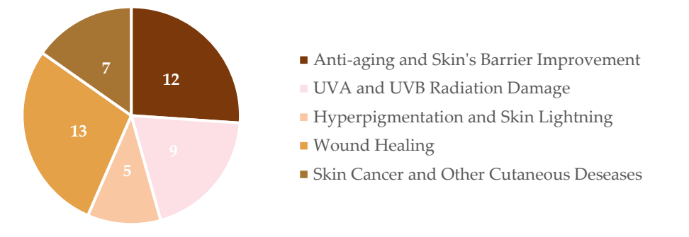
Figure 2. Number of papers related to hesperidin's biological activities on skin from the last decade. The works that followed under the scope of "Biological Activities on Skin" (previously defined) were subdivided into "Anti-Aging and Skin's Barrier Improvement", "UVA and UVB Radiation Damage", "Hyperpigmentation and Skin Lightning", "Wound Healing" and "Skin Cancer and Other Cutaneous Diseases".

The papers were analyzed and selected accordingly with the specified criteria. The considered articles were divided into the themes "Reviews", "Extraction and Purification Methods" and "Biological Activities on Skin".