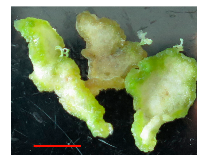
Figure 3. Transgenic plant regeneration of tobacco ( Nicotiana benthamiana ). Bar = 1 cm.

Figure 2. Generation of the Arabidopsis AtBRI1 mutant. ( A ). AtBRI1 mutant with phenotypes (right). ( B ). The mutation was detected by sequencing. WT: wild-type Arabidopsis. Bar = 1 cm.