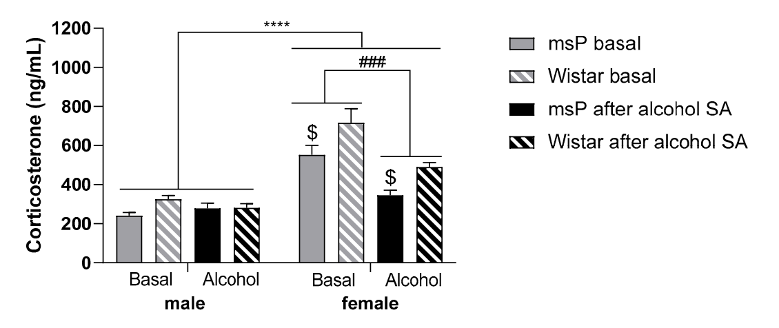
Figure 3. Blood corticosterone (CORT) levels under basal conditions and after alcohol SA sessions in male and female msP and Wistar rats. Females displayed significantly higher blood CORT levels than males independently of rat strain. Female Wistars had higher CORT levels than female msPs. Alcohol consumption decreased basal CORT levels in female animals only. In both rat lines, CORT levels of male rats remained unchanged following alcohol SA. Data are presented as mean \pm SEM. Main effect of sex: **** p < 0.0001; main effect of sex x alcohol condition: ### p < 0.001; $ p < 0.05 vs. msP same condition and sex (sex x strain interaction).