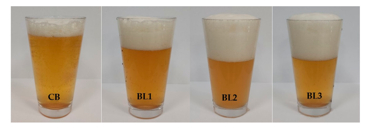
Figure 1. Appearance of the wheat beers obtained from left: control (CB), wheat beer with 1% m/v (BL1), 2.5% m/v (BL2) and 5% m/v (BL3) lemongrass addition.

The colour of the beers depends significantly on the malt composition used for mashing. The addition of lemongrass affected the colour of wheat beers, and an increase in the concentration of lemongrass in the finished product significantly affected the colour of the beers, which ranged from 16.9 to 21.5 EBC units (Table 1, Figure 1). In a study by Baigts-Allende et al. [20], citrus-infused barley beers were characterised by a colour level of 5.8 EBC units. Patraşcu et al. [21] evaluated the colour in lemon and grapefruit beers and it was at 6.75–6.83 EBC units and 16.98–17.36 EBC units, respectively.