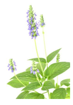
Figure 1: The plant of Salvia hispanica L. [17]

Lately, there have been many new discoveries regarding to nutritional properties, phytochemicals and extraction methods regarding to Chia seeds. The aim of this study is to present these findings, nutritional and therapeutic potential, focusing on extraction methods used on Chia seed.