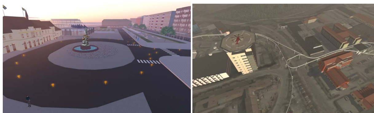
Figure 5: Left: Waypoints for cars and buses. Right: section of the pod car track.

On the positive side, the podcar system, given that it doesn't yet exist, has been much more amenable to automation. We have automatically generated both the tracks and the routes from an existing plan (see Figure 5, right).