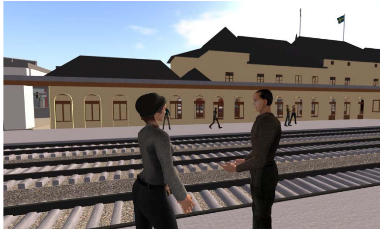
Figure 6: Bots enacting pedestrians.

Since 0.7.3, OpenSimulator supports server-side bots that are scriptable in-world. We have used that facility to create over 100 standing/sitting bots and a dozen of walking ones. The standing/sitting bots are very lightweight; the servers can handle hundreds of them. The walking bots, on the other hand, are relatively heavy, as they are part of the physics scene. The walking bots will be subject of substantial improvements in future virtualizations.