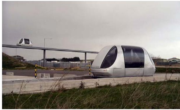
Figure 1: Pod cars in the Heathrow airport.

PRT systems, however, are far from being incremental changes over our existing cities' infrastructures; on the contrary, they require a substantial reconceptualization of our cities, and, partly due to that, they have generated considerable controversy over the years. Several concerns have been voiced of technical, operational, regulatory and aesthetical nature. For example, some doubt the cost-effectiveness of this mode of transportation in densely populated cities [38]. Others doubt whether small vehicles provide enough capacity to serve the large crowds that are offloaded in mass transit stations. With respect to urban design, the tracks are elevated, not at ground level; this results in uncertainties about how such systems will look and feel as people walk under them and see them through their windows. In [8], Cottrell gives a good overview of the issues surrounding PRT systems and of the research that has been published about them over the years.