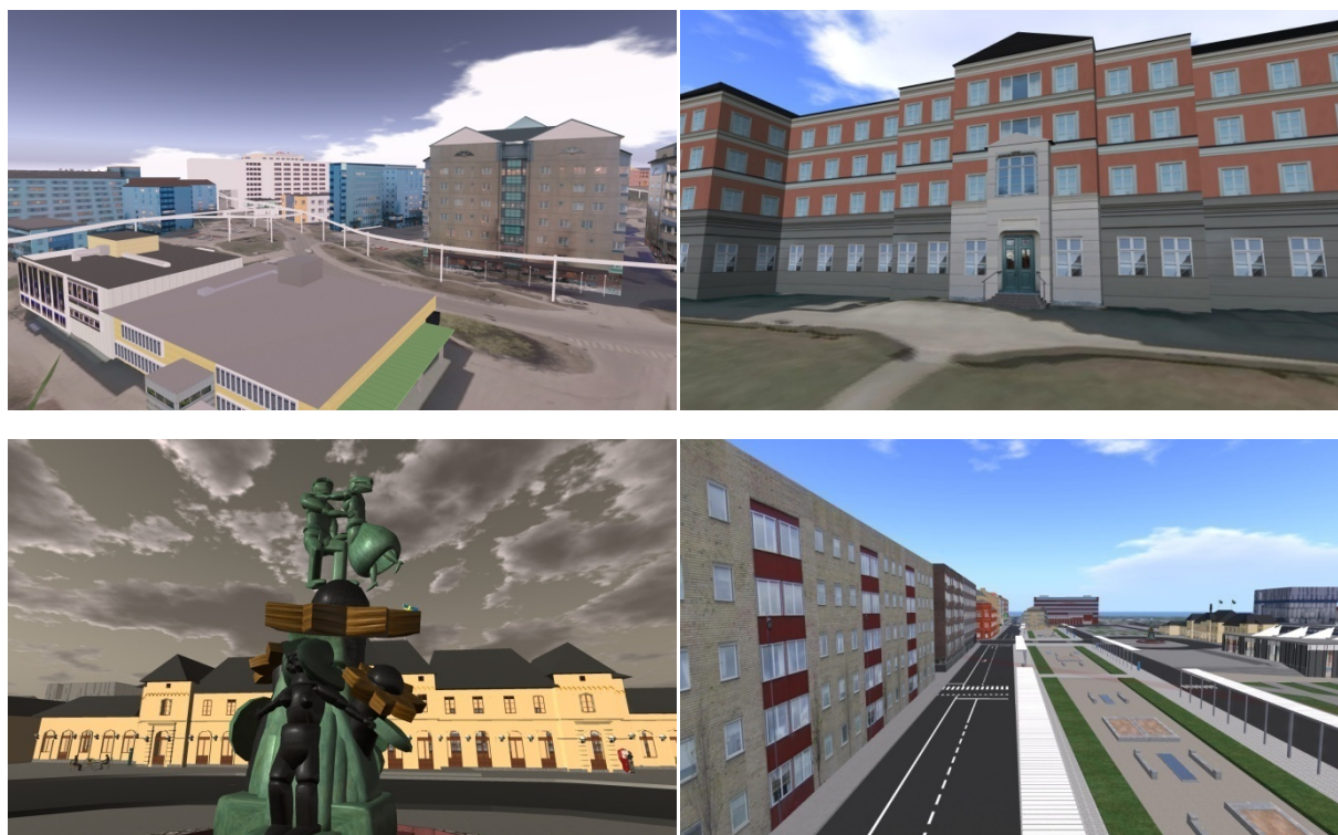
Figure 4: Examples of buildings in the virtual Uppsala city.