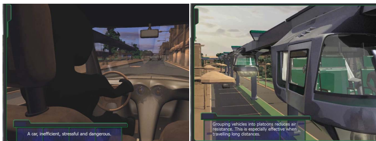
Figure 7: Pictures from a computer animation movie produced using Maya during the course of this project.

During this project, additionally to the virtual reality environment described here, but separate from it, a conceptualization video was produced using Maya (Site 7). This computer animation movie depicts a rendition of the city of Uppsala and how a pod car system would look like in it. The movie has a marketing/educational tone to it. Pictures from this video are presented in Figure 7. This artifact allowed us to get anecdotal data pertaining to the stakeholders' reactions to the different media.