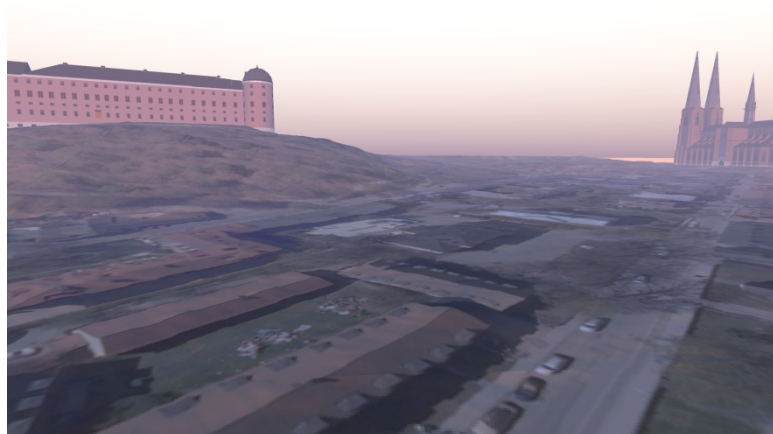
Figure 3: Terrain detail. Mesh consisting of elevation data and aerial image

With an external toolset, we are able to generate terrains from GIS data, embedded with aerial images. These realistic aerial-image terrains, by themselves, provide a fair amount of immersion, even before any building is modeled. They also give us the footprint for placing the buildings in the scene and for visualizing the roads and vegetation (see Figure 3).