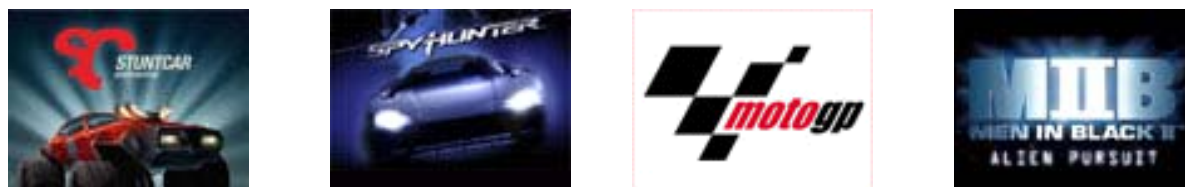
Figure 4: Examples of X-Forge powered games

The other core competencies of the company include the know-how of 3D graphics technologies, optimizing for the limited hardware configurations of mobile devices and the development of high quality games. The company has developed a technology platform which is available for mobile gaming devices including nGage, Sony PSP and Tapwave Helix.