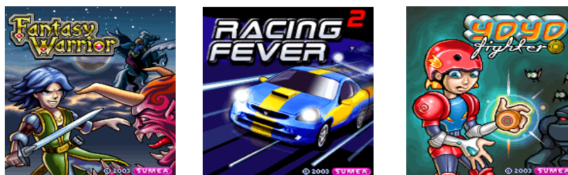
Figure 3: Examples of Mobile games from Sumea.