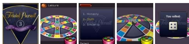
Figure 2: Screenshots of Trivial Pursuit from the screen of a mobile device

Another example of the games in Mr. Goodliving's product portfolio is mobile games ported from other environments into mobile handsets, like the popular board game Trivial Pursuit (see Figure 2). There are probably millions of Trivial Pursuit players in the world. The initiative to produce a mobile phone version of the board game came from its marketer, an American toy and game company Hasbro, Inc.